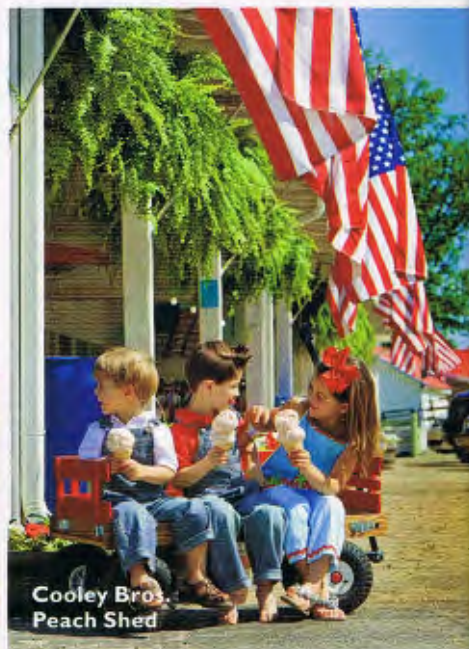
Cooley Bros. Peach Shed

Bottletree Blonde ($3.50), a crisp brew from nearby Tryon, North Carolina.