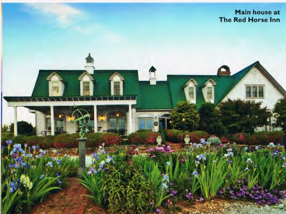
Main house at The Red Horse Inn